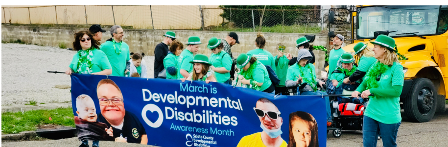
PAGE 3 | SCDD PARTICIPATES IN 1ST ST. PATRICK'S DAY PARADE SINCE BEGINNING OF PANDEMIC