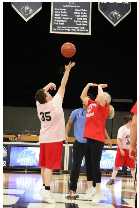
PAGE 2 | CARDINALS VS STAFF GAME