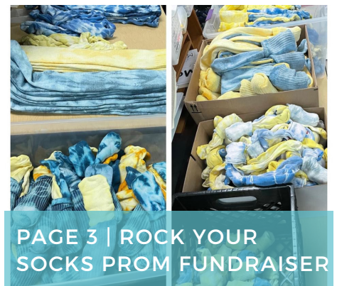
PAGE 3 | ROCK YOUR SOCKS PROM FUNDRAISER