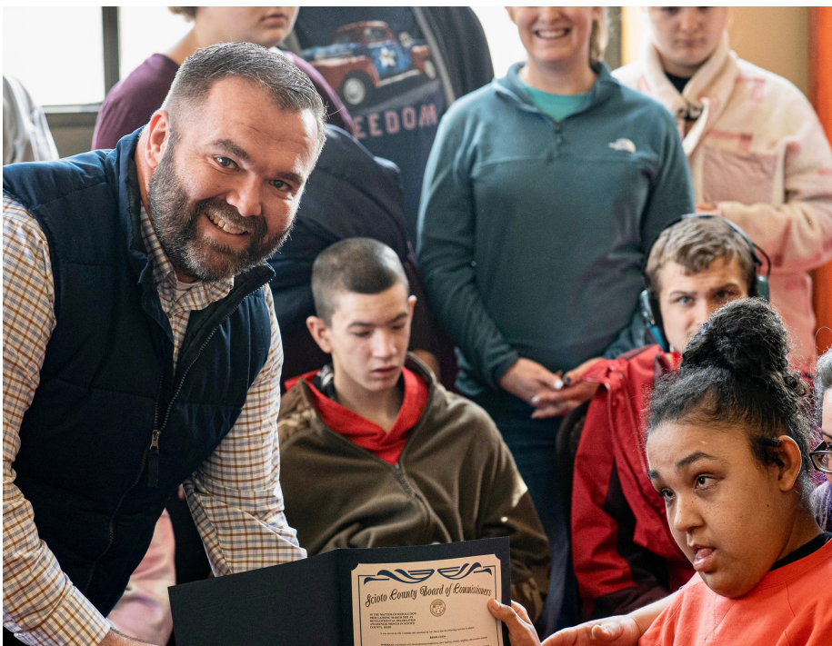
PAGE 1 | SCIOTO COUNTY COMMISSIONERS PROCLAIM MARCH AS DD AWARENESS MONTH

The month where we celebrate Autism is right around the corner. The Autism Project of Southern Ohio has some fun events planned! pg. 5